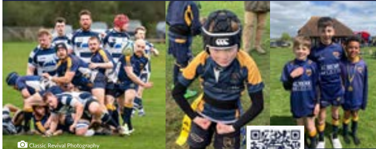
Classic Revival Photography

Harvey's Sussex Counties League Training Wednesdays 7.15pm